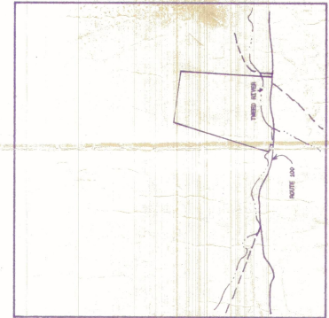
VICINITY MAP 1" = 2000'