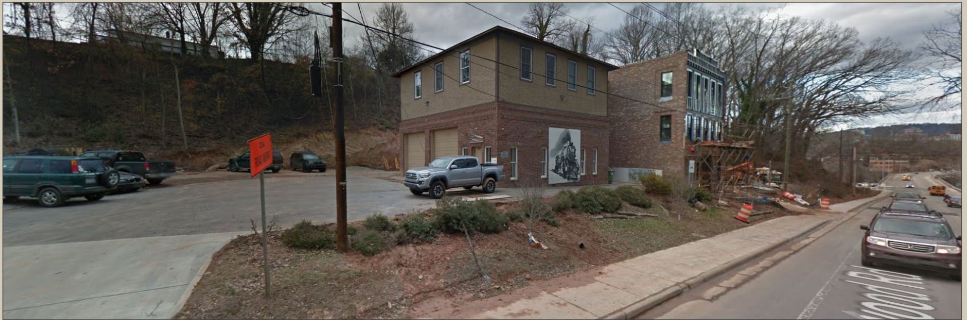
49 Haywood Road - River Arts District right down the street with sidewalk access