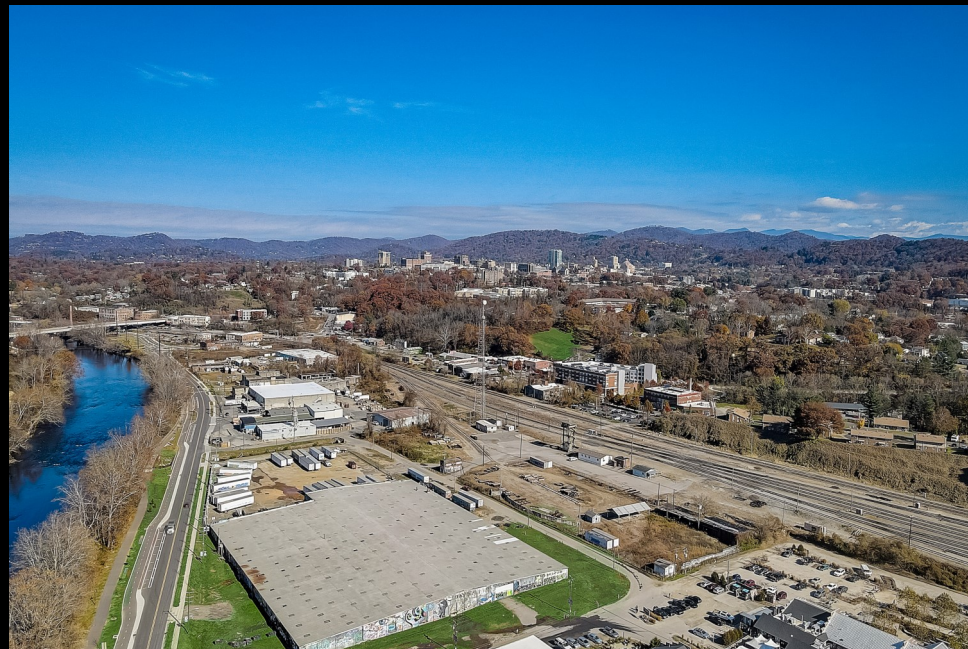
372 Depot Street Proximity