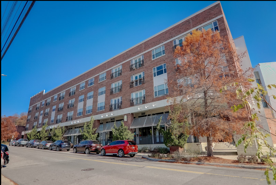
Street Parking Space