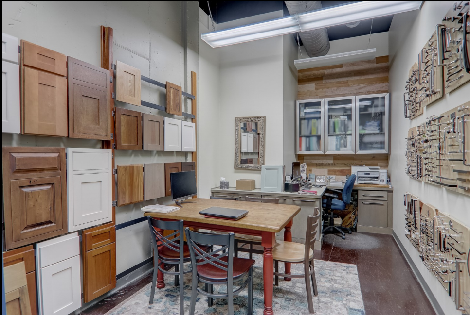
Third Office Suite