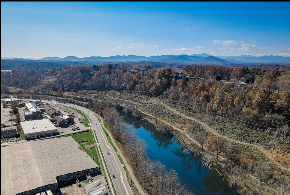
River View Station