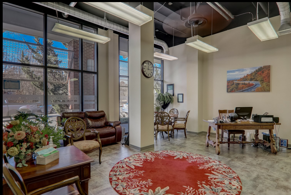
Front Office Suite