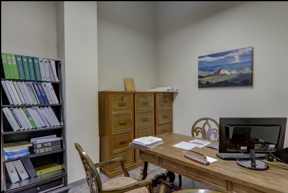
Fifth Office Suite