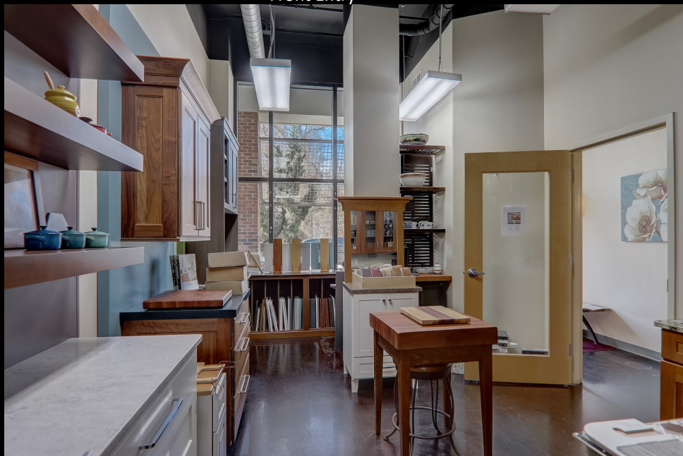
Second Office Suite