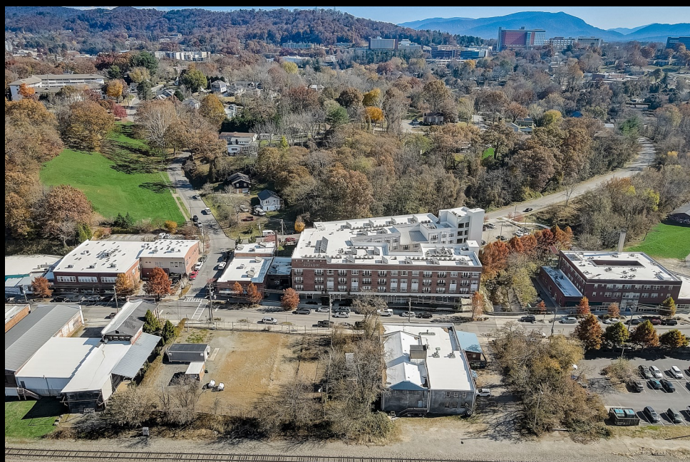
372 Depot Street