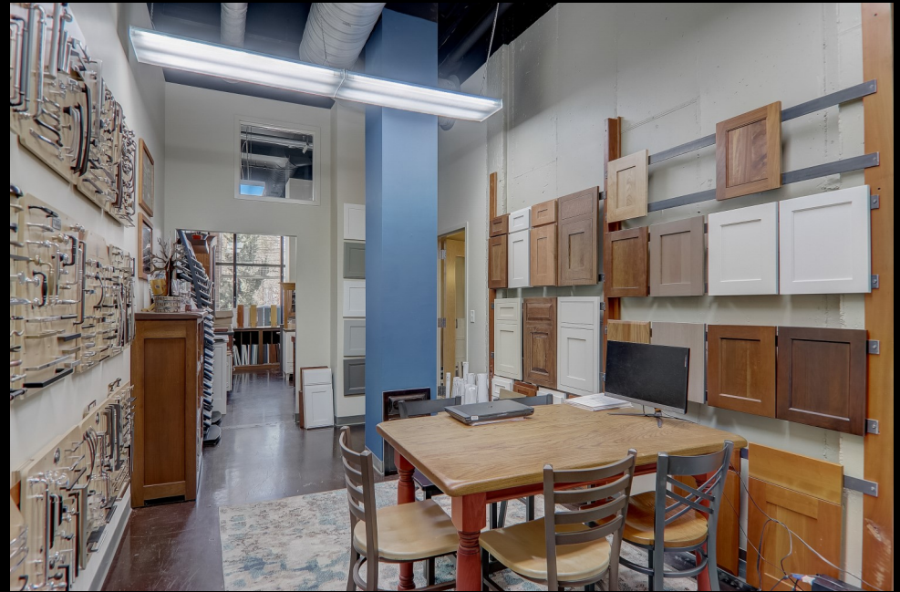
Fourth Office Suite