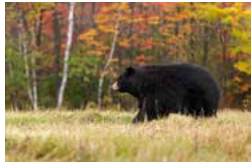
** Not on property