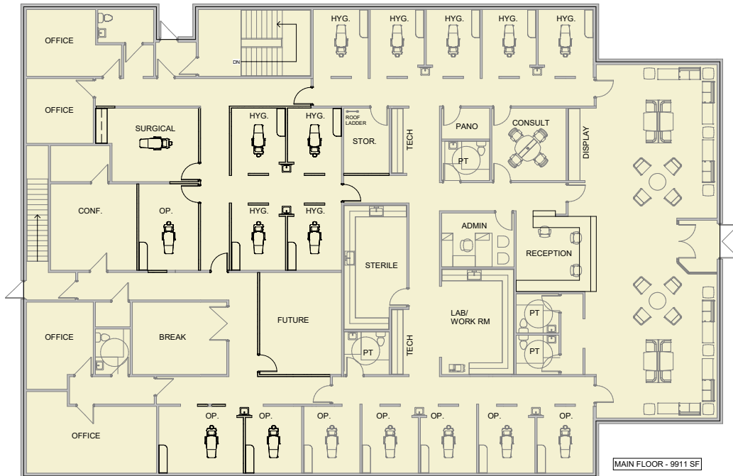
2 MAIN FLOOR PLAN - FUTURE 1/8" = 1'-0"