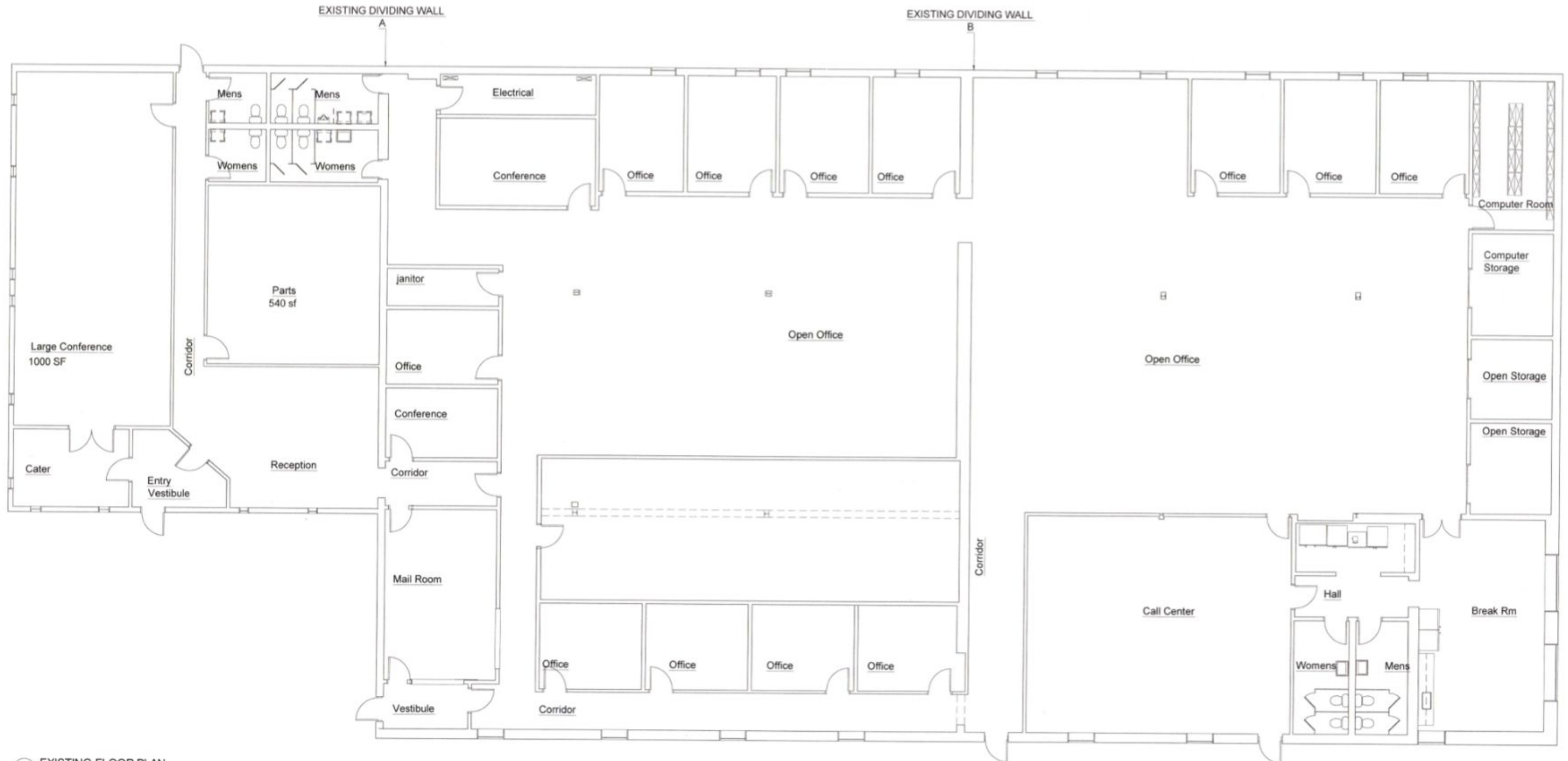
1 EXISTING FLOOR PLAN Scale: 1/8" = 1'-0"