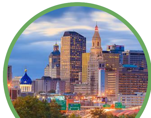
HARTFORD 30 Minutes