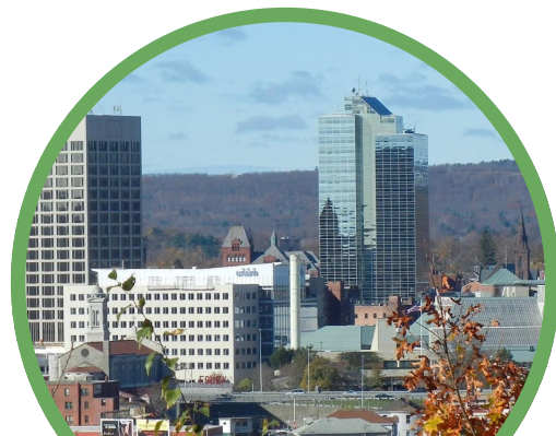
WORCESTER 1 Hour 20