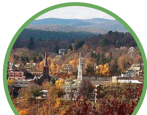
BRATTLEBORO 21 Minutes