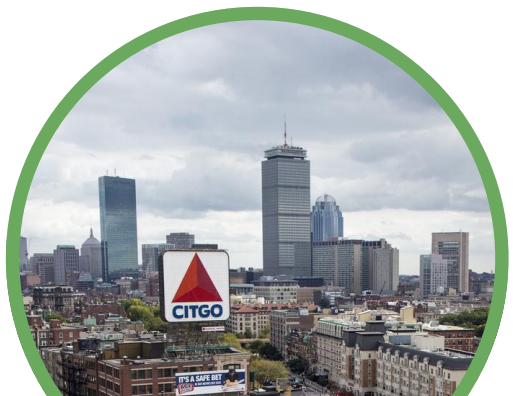
BOSTON 90 Minutes