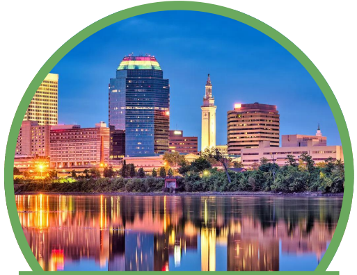
SPRINGFIELD 11 Minutes