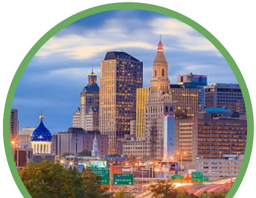
HARTFORD 31 Minutes