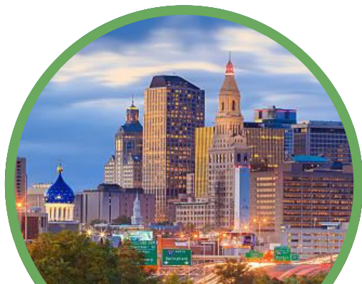
HARTFORD 45 Minutes