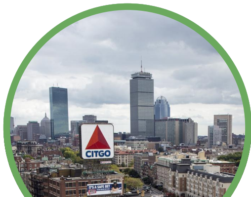
BOSTON 100 Minutes