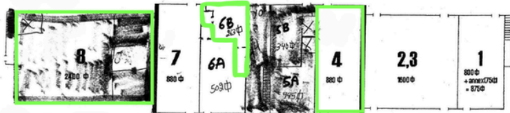
1ST LEVEL - STORES

SOUTH TOWNE COMMONS - 479 WEST STREET - AMHERST, MA 01002