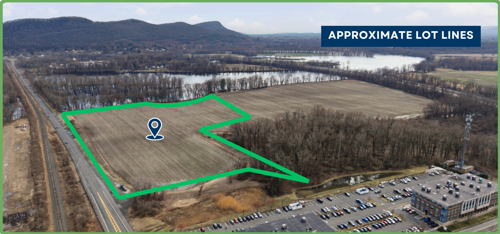
APPROXIMATE LOT LINES