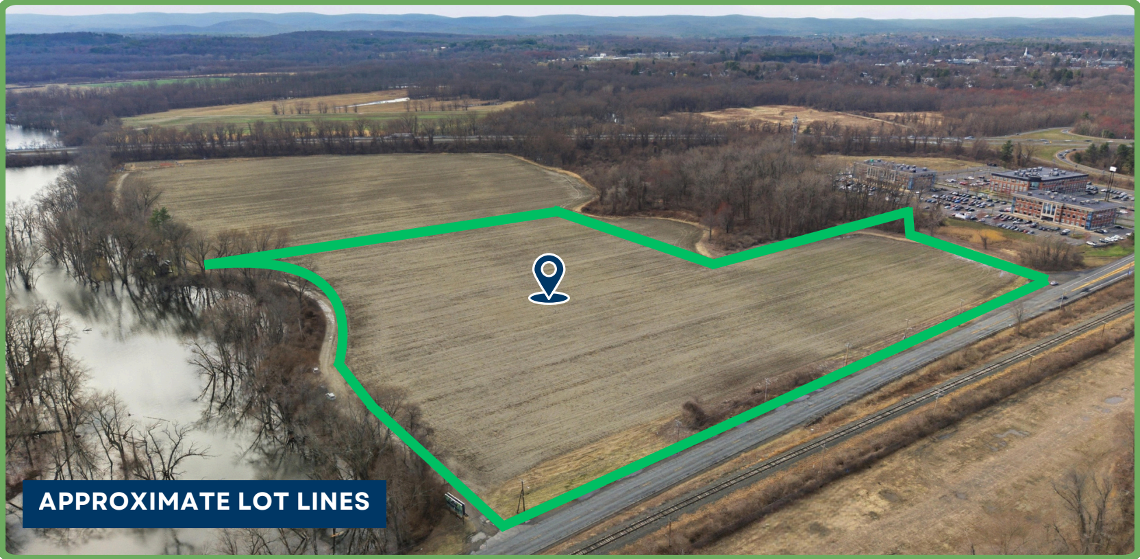
APPROXIMATE LOT LINES